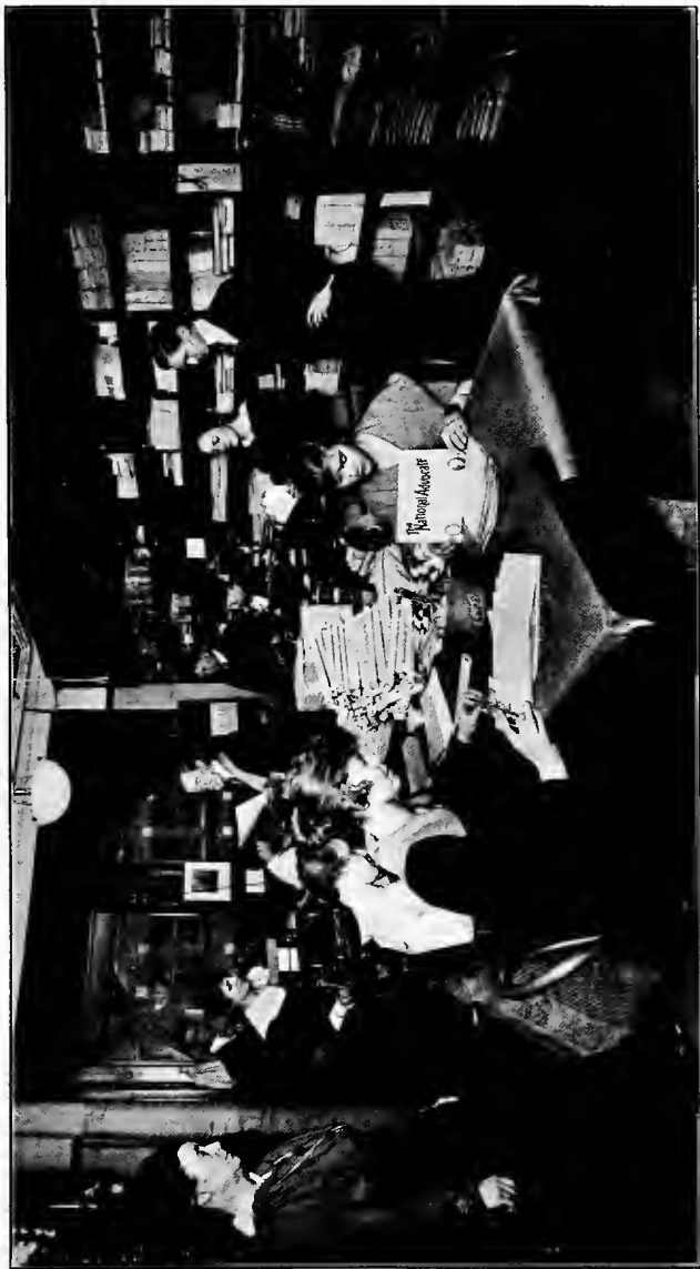
One of the "Work-Shops" of the Federal Council's Publication Department